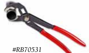
#RB70531 ROLOCK 7" Pliers