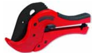
#RB52030 ROCut 63TC Plastic Pipe Shear