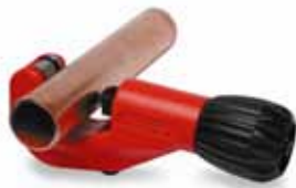
#RB70027 PRO 35 Tube Cutter

Duracable Manufacturing is now the proud distributor of Rothenberger® tools. When it comes to plumbing installation or repair, Rothenberger has the solution. Rothenberger hand and power tools are the perfect choice for the professional plumber.